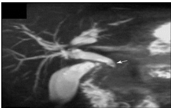
Figure 1. Coronal MIP Filling Defect (Calculus) in the Common Bile Duct (Arrow)