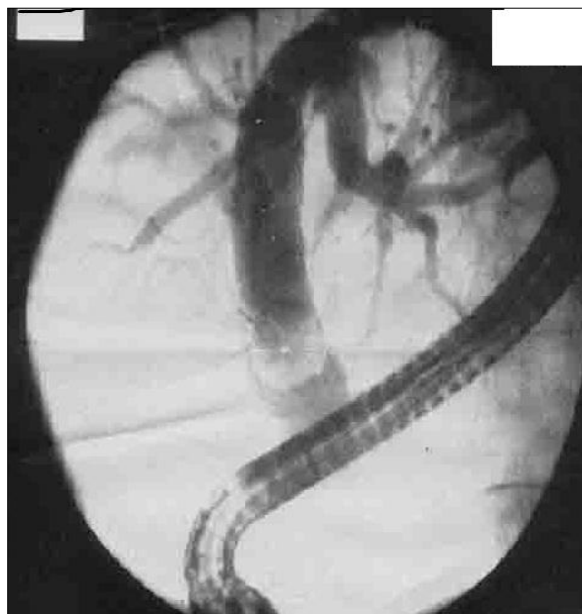
Figure 3. ERCP Showing Calculus in Dilated CBD