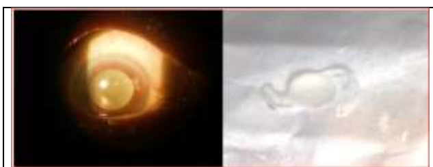
Image 2. Opacified IOL and the Explanted Acrylic Lens

IOL exchange was advised. During surgery the IOL was found to be in the sulcus. It was explanted without disturbing the bag and a rigid PMMA IOL was placed in the sulcus. Thus explanting an IOL from the sulcus and careful implantation of the new lens in the sulcus can prevent damage to the capsular bag. The explanted IOL was found to be foldable lens, probably made from hydrophilic Acrylic material. Her BCVA after IOL exchange improved to 6/12.